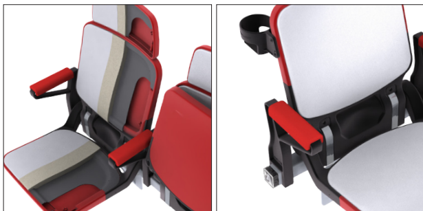
Highly durable recessed upholstery, in a selection of commercial grade leatherette fabrics.